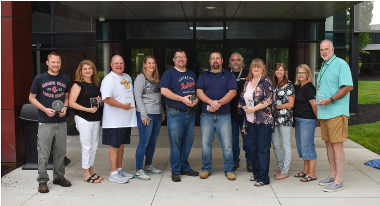
Years of Service Recognition Award Recipients