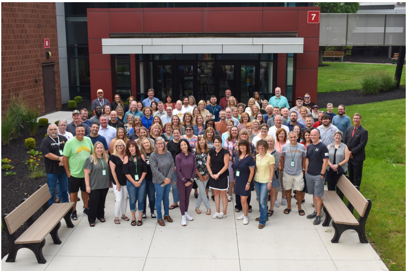
CVCC Staff Photo