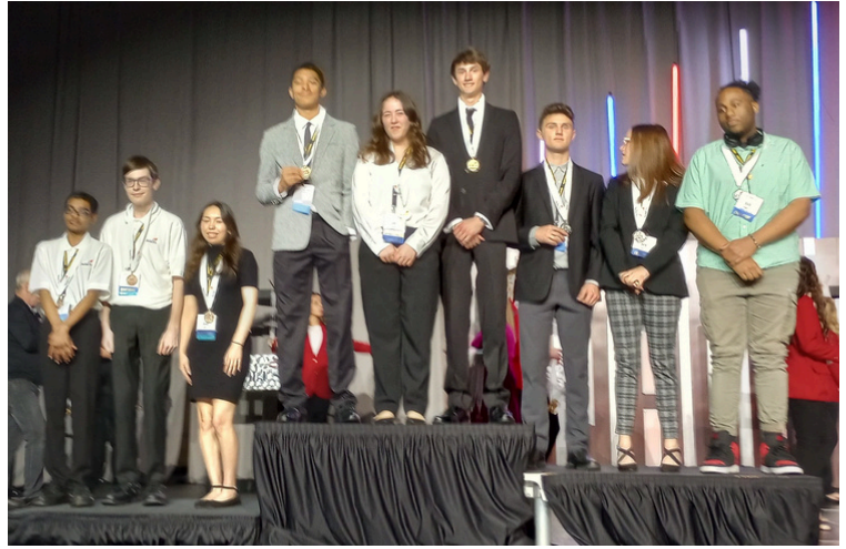
Creative Sculpture Contest team - 3rd Place