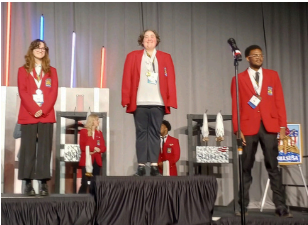
Pin Design - 1st Place