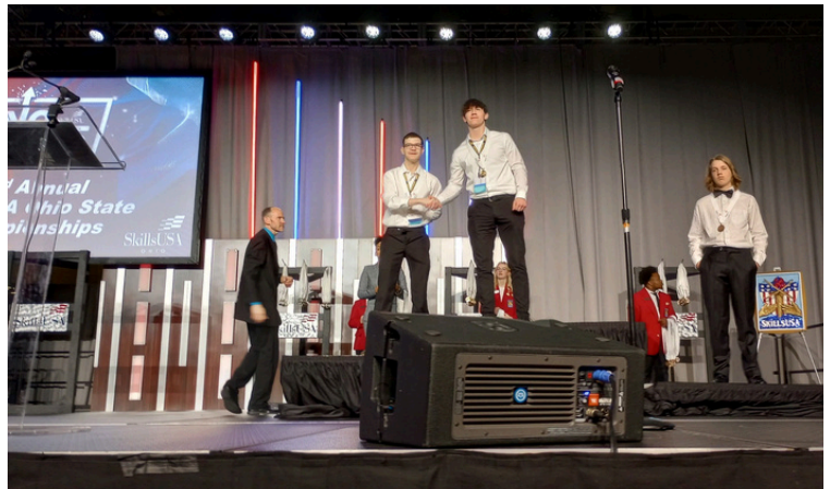
CNC Technician - 2nd Place