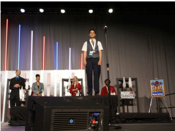
Sheet Metal - 1st Place