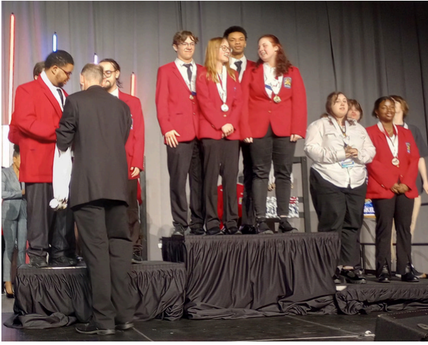
Broadcast News Production team - 3rd Place