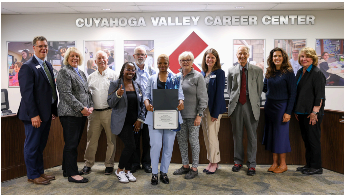
*Pictured: Adult Diploma graduate pictured with CVCC Board Members